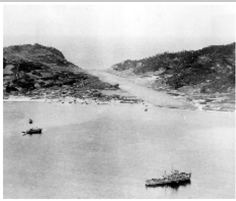
An aerial view of the emergency airfield on Yo Do - June 26, 1952, the day the Seabees finished the runway.

The 7th Fleet commander, Vice Adm. Robert P. Briscoe, carefully weighed all the factors involved. A 1953 Navy press release characterized this analysis much like an accountant gazes at a balance sheet. While there were concerns for how the North Koreans would react to construction of an airfield, Briscoe felt that salvage of a single plane was worth the effort. In the end, it cost the Navy $5 million to save nearly $10 million in aircraft.