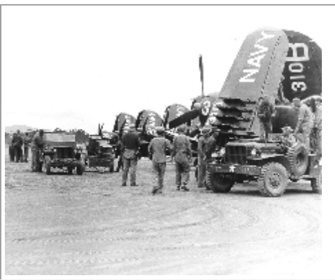
Seabees refueling seven Corsairs on Yo Do on July 15, 1952.