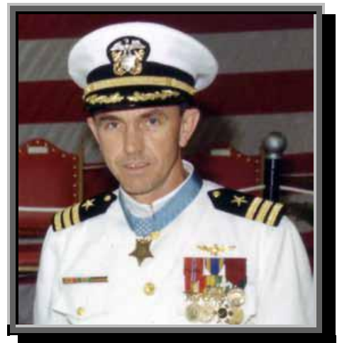
Cmdr. Clyde Lassen, CO Helicopter Training Squadron 8 (HT-8)

On April 21, 2001, the United States Navy commissioned USS LASSEN (DDG-82) in his honor.