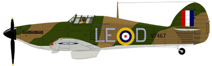
A Hawker Hurricane Mk 1 in 242 Squadron markings

On 30 October 1939, No 242 reformed at Church Fenton as a fighter squadron and initially had a large number of Canadian personnel on strength. In December it received Blenheim fighters which were replaced in January 1940 by Hurricanes, the squadron becoming operational on 23 March. Operations over France began on 16 May, a detachment being based at French airfields until evacuated on 16 June to take part in the Battle of Britain.