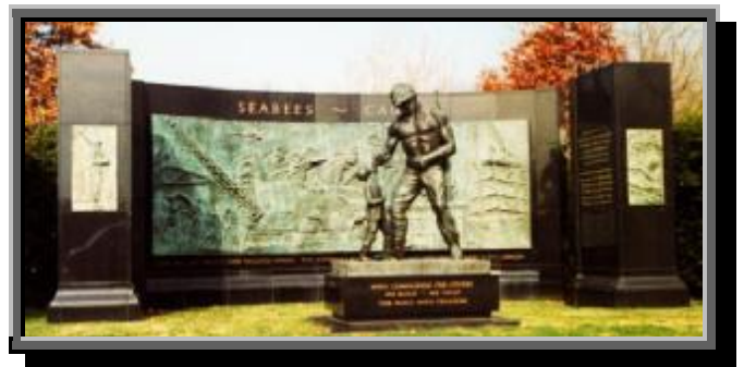
The SeaBee Memorial Monument, Washington, D.C.

The SeaBee Memorial is located at the entrance to Arlington National Cemetery. The nine-foot sculpture of a SeaBee is shown holding the hand of a little child. The inscription on the base: "With Compassion For Others – We Build – We Fight – For Peace with Freedom." The motto "SeaBees – Can Do" is inscribed over a panorama of SeaBees at their various trades. Below are the words: "With Willing Hearts and Skillful Hands – the Difficult We Do At Once, The Impossible Takes a Bit Longer."