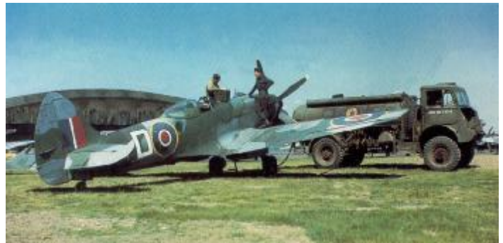
Our Spitfire will eventually have colors much like the Spit in this photo – a Mk.XIV of 414 (RCAF) Squadron, Wunstorf, Germany, April, 1945.

At the moment, the aircraft is finished in South East Asia markings. This is about to change, as we are considering a European color scheme and the markings of 41 Squadron, which flew low-backed F Mk.XIVs with the 2 nd Tactical Air Force from former Luftwaffe bases in liberated Europe in 1945, scoring many victories over a wide range of German Air Force types, including a number of jets. 41 Sqn. is one of the oldest still serving with the RAF today after 92 years of continuous service.