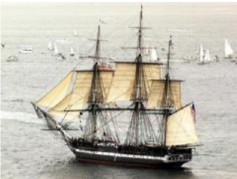
U.S.S. Constitution in Boston Harbor

To this day, the USS Constitution is a commissioned frigate in the U.S. Navy, berthed in Boston, MA.